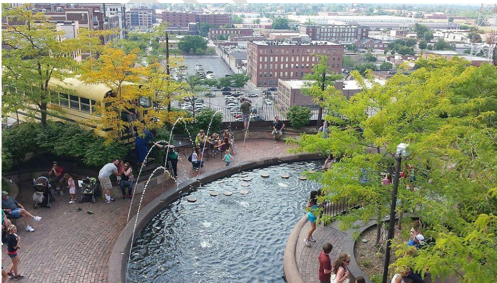
The City Museum