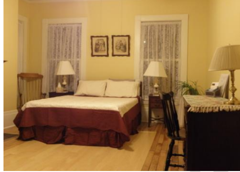
Worlds' Fair Room