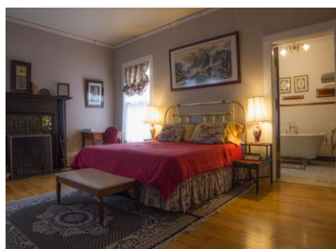
The Presidents' Room