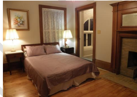
Judge Sears Room