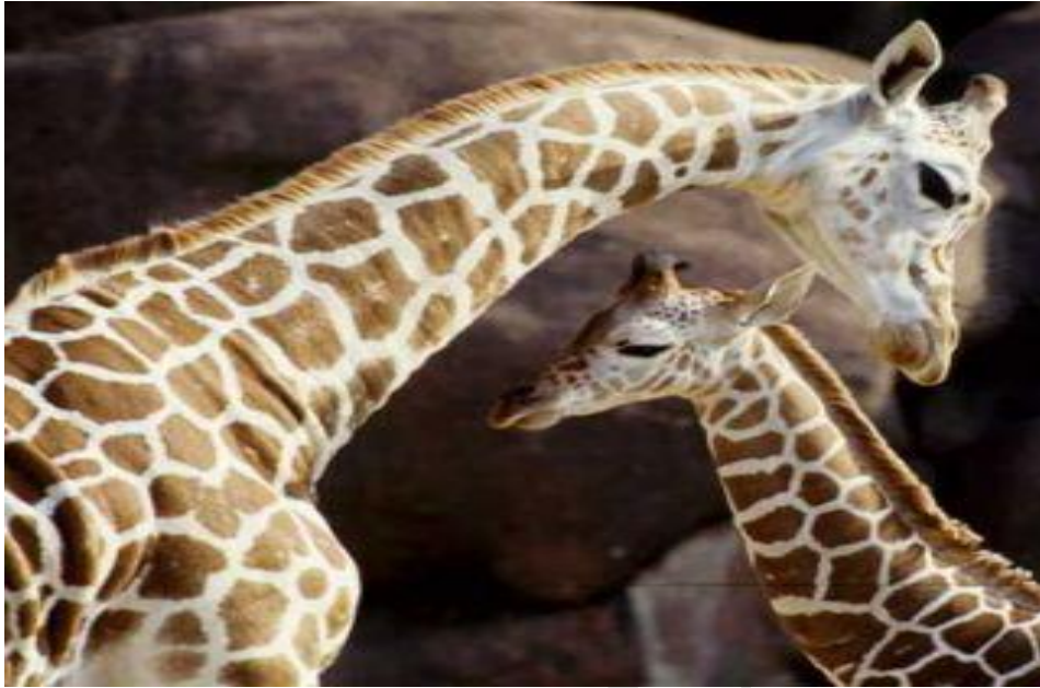
The St. Louis Zoo